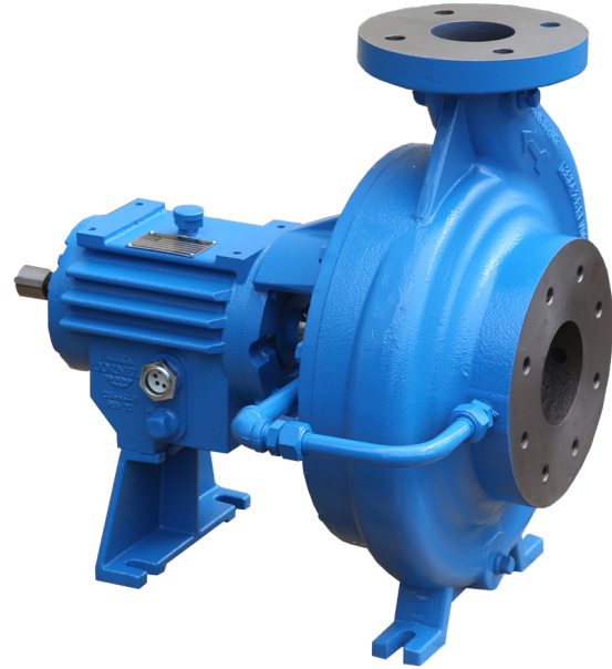
A typical picture of the pump is shown. Please contact Cornell Pump Company for further details. All information is approximate and for general guidance only.