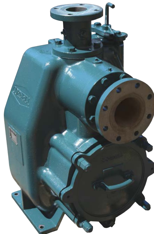
A typical picture of the pump is shown. Please contact Cornell Pump Company for further details. All information is approximate and for general guidance only.