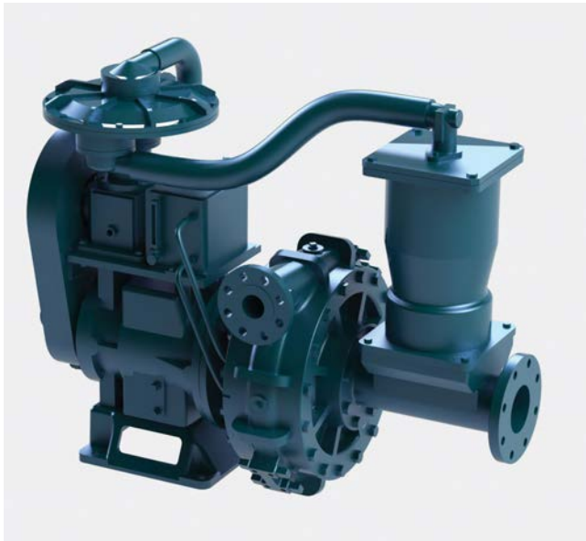
A typical picture of the pump is shown. Please contact Cornell Pump Company for further details. All information is approximate and for general guidance only.