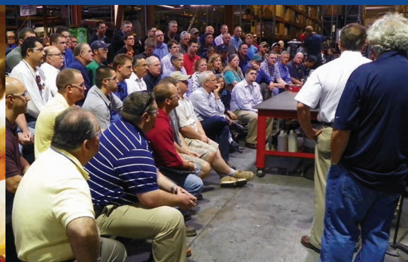
LIVE DEMONSTRATIONS WITH HANDS ON TRAINING